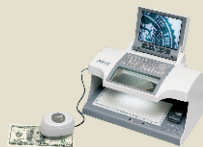
PRO CL-16 IR LCD